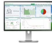
PME with Unlimited Devices